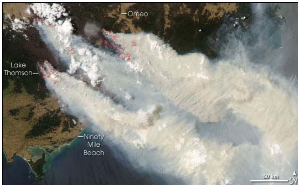
Figure 2. Satellite photograph of bushfire smoke on January 11, 2007

When the skies cleared on January 10, 2007, it was obvious that fires that had been burning in the area since early December 2006 were still raging.