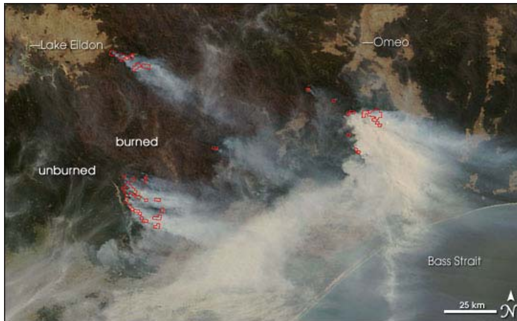
Figure 1. Satellite photograph of bushfire smoke on January 10, 2007

When the skies cleared on January 10, 2007, it was obvious that fires that had been burning in the area since early December 2006 were still raging.