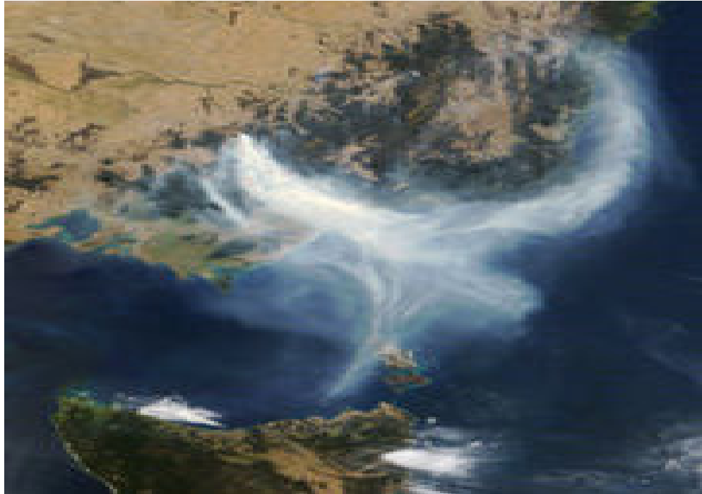
Satellite image of South Eastern Australia on 8 December 2006 showing the extensive bushfire smoke plume.